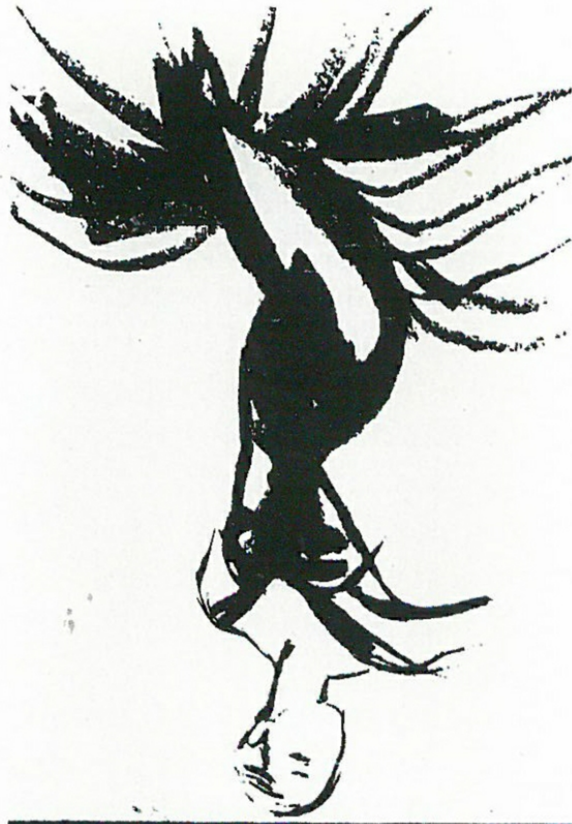
INVERTED ELEGANCE AN AFFECTIONATE CHRISTMAS NOTE FROM THE COUTURIER TO LONG, 1975.